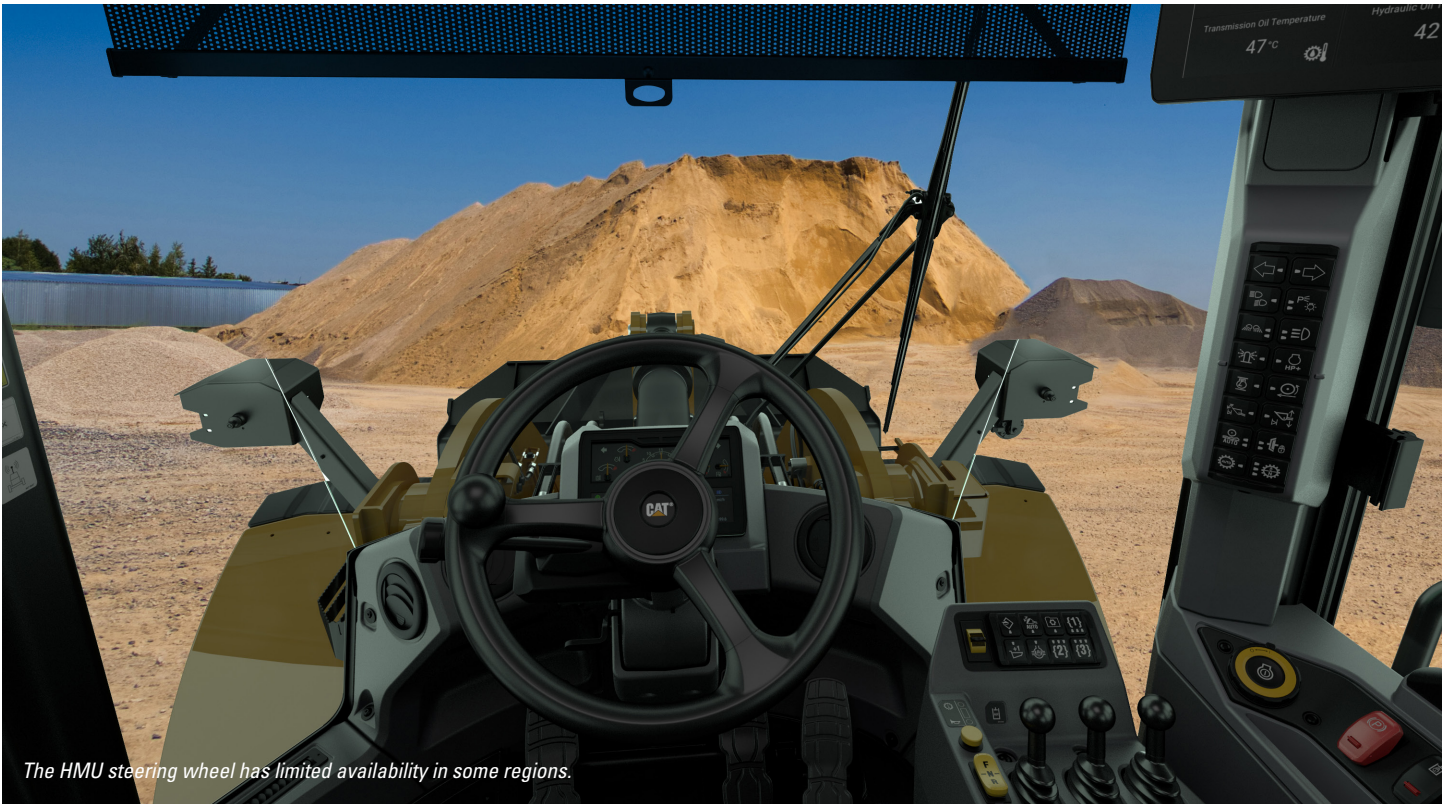
The HMU steering wheel has limited availability in some regions.

The cab is designed to maximize comfort and productivity, offering a quieter, more spacious operating environment and intuitive controls to help reduce the fatigue, stresses, sounds, and temperatures of a demanding job.