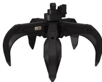
ORANGE PEEL GRAPPLES